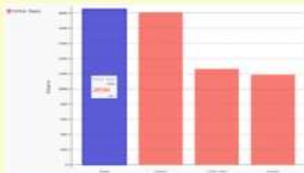
chart = pygal.Bar() chart.force_uri_protocol = 'http' chart.x_labels = [ 'django', 'requests', 'scikit-learn', 'tornado', ] chart.y_title = 'Stars' chart.add('Python Repos', repos) chart.render_to_file('python_repos.svg')

import pygal repos = [ { 'value': 20506, 'color': '#3333CC', 'xlink': 'http://djangoproject.com/', }, 20054, 12607, 11827, ]