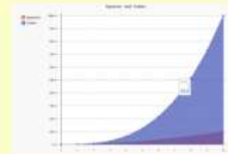
chart = pygal.Line(fill=True, zero=0)

Pygal allows you to fill the area under or over each series of data. The default is to fill from the x-axis up, but you can fill from any horizontal line using the zero argument.